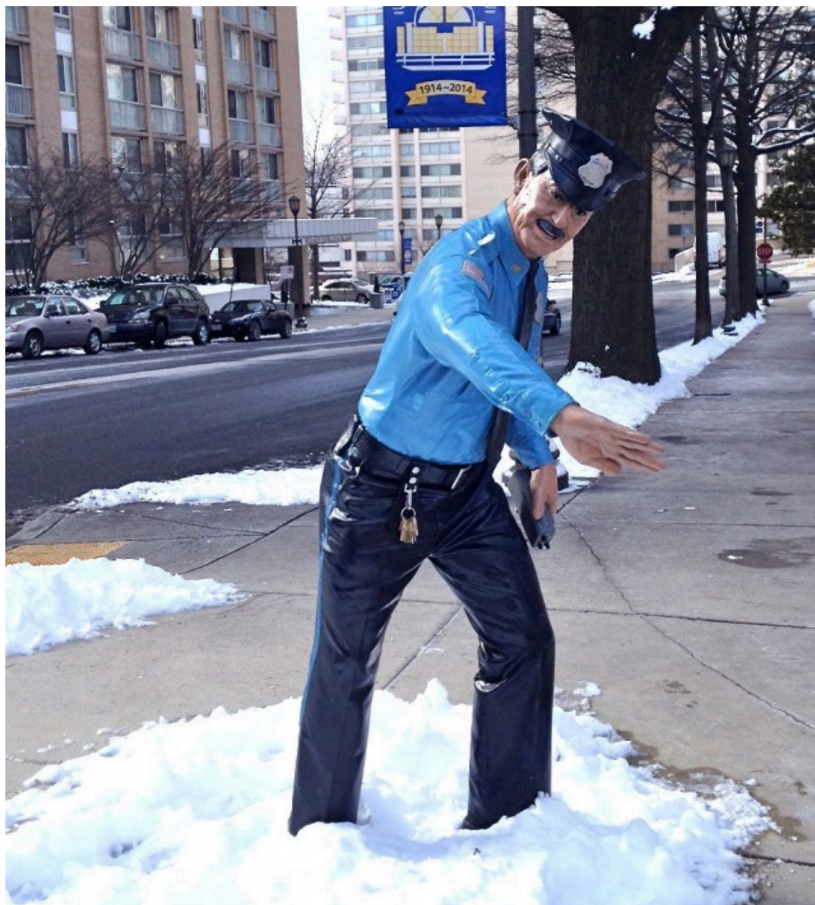
The sculpture, shown in 2014.

It also serves as a safety device, meant to catch the attention of drivers and pedestrians at the intersection. Its outstretched right arm is to remind drivers to stop for pedestrians and pedestrians to be careful. It cost the village $70,000 to build and install in 2000.