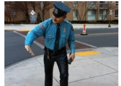
The police officer sculpture in Friendship Heights was installed in 2000